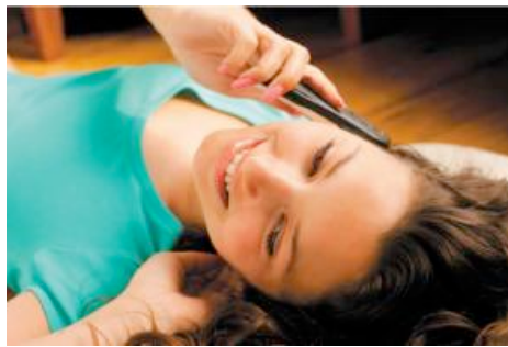
Young people are at particular risk from exposure to radiation